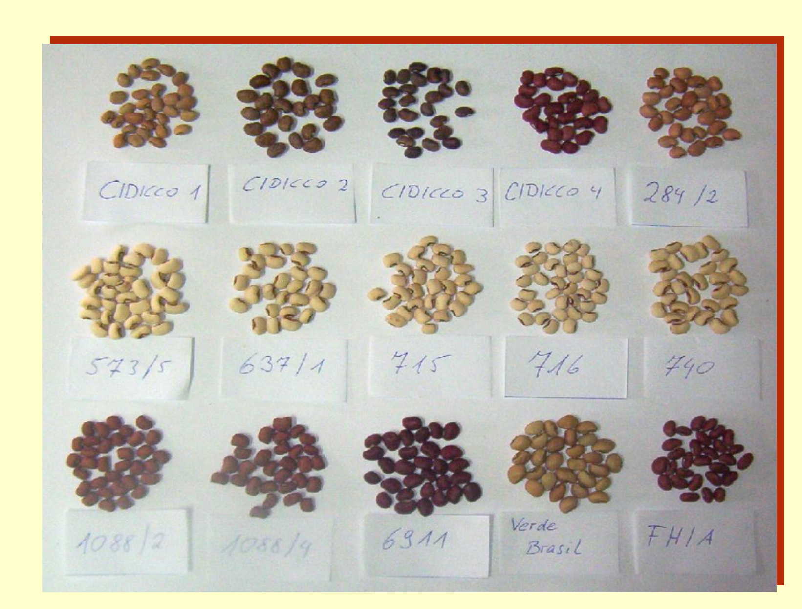
Figure 3. Farmers assessing cowpea ( Vigna unguiculata ) during a participatory evaluation (left); seed characteristics (size, colour, even taste) are important critera (right)