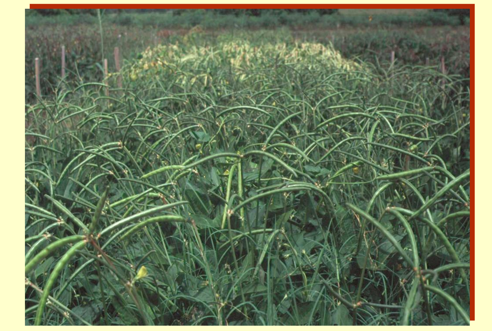
Figure 3. Plots of cowpea (Vigna unguiculata)